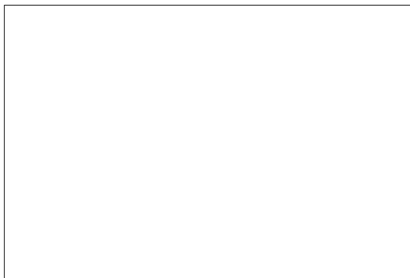
Figure 1. Example of caption. It is set in Roman so that mathematics (always set in Roman: B \sin A = A \sin B ) may be included without an ugly clash.

When citing a multi-author paper, you may save space by using “et alia”, shortened to “ et al. ” (not “ et. al. ” as “ et ” is a complete word.) However, use it only when there are three or more authors. Thus, the following is correct: “Frobination has been trendy lately. It was introduced by Alpher [1], and subsequently developed by Alpher and Fotheringham-Smythe [2], and Alpher et al. [3].”